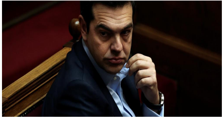
Greek prime minister Alexis Tsipras answers questions in parliament, 10 February 2017